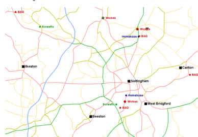
Store finder postcodes